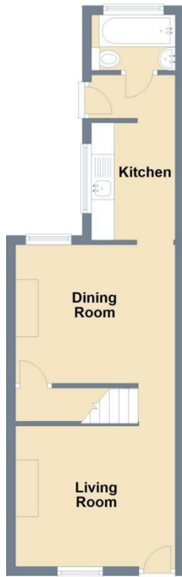
Ground Floor Approx. 34.3 sq. metres (369.2 sq. feet)